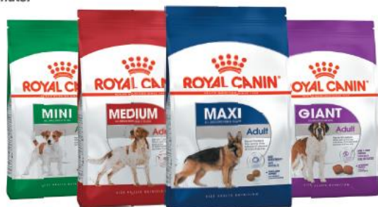
Part of the ROYAL CANIN® Size Health Nutrition range.

Become a ROYAL CANIN® PRO Club member today and unlock preferential PRO Club pricing, educational seminars and quarterly rewards for regular purchases.